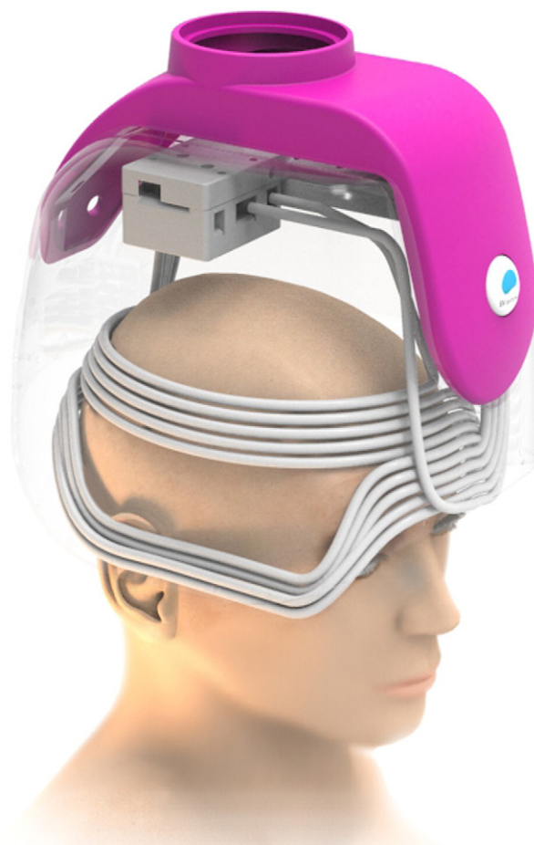
Fig. 1. Schematic of right hemisphere H12 coil in prime position. Note the relatively broad distribution of the stimulating elements over the right hemisphere.

At each rTMS session, the patient completed a side effects questionnaire. Specifically, presence and severity of headache, neck pain, and scalp pain/irritation were assessed before and after each rTMS session. In addition, after each rTMS session, the patient reported whether she had trouble hearing, thinking, or concentrating, or had changes in mood, or had any other subjective symptoms compared to before the start of the session.